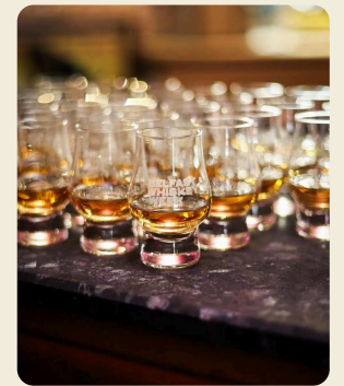
KILLOWEN STILLHOUSE · DRAWING FROM THE CASK · THE MOURNES · A TRY 3 DRAMS FLIGHT